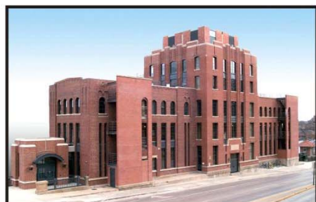
C. Maxwell Stanley Hydraulics Laboratory: Offices, Classroom, Reference Room and Administration