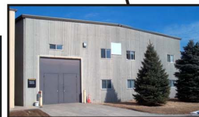
Wind Tunnel Annex: Wind Tunnels to Support Fluids Research and Education