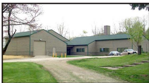
Lucille A. Carver Mississippi Riverside Environmental Research Station (LACMRERS): Research and Education Center on the Mississippi River near Muscatine, Iowa