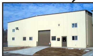
East Annex: Cold Regions Lab and Environmental Flow Facility