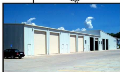
James Street Building: Hydraulics Modeling