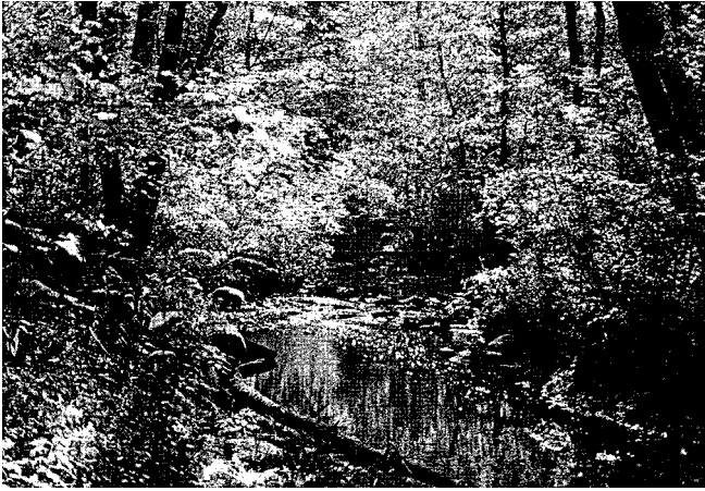
FIG. 2. The Study of Movement of Water, Sediment, and Pollutants through a Stream Surrounded by Wetlands (Reedy Creek, Caroline County, VA) Constitutes an Important Component of Environmental Hydraulics