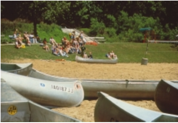
Springbrook State Park (Guthrie County)