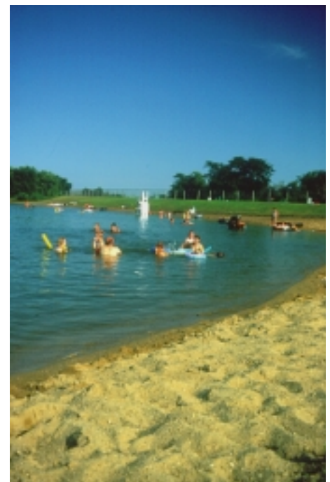
George Wyth State Park (Black Hawk County)

In 2000, beach monitoring was expanded to thirty-one Iowa beaches. From May through September, the beaches were monitored each week in order to obtain bacteria levels and determine the weekly variability of bacteria levels at each beach (Figure 1). Other goals were to identify factors that impact the bacteria levels and assess the risk of each beach to bacterial contamination. In addition to weekly monitoring, four beaches were sampled twice daily from late May through early July to determine the daily variability in bacteria levels at these beaches.