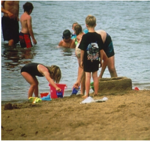
Abquabi Beach (Warren County)

Elevated bacteria levels were also found at the four beaches monitored daily (Lake Macbride, Lake Ahquabi, Big Creek, and Black Hawk Lake). However, the elevated bacteria levels were short-lived, persisting for 24 to 48 hours following runoff-producing rains. In other words, beach bacteria levels rise quickly in response to heavy rains and drop quickly once the rain stops. Overall results from beach monitoring show that bacteria levels were low at the majority of Iowa beaches. Rain appears to be one of the most important factors in predicting whether or not bacteria levels will rise at a beach. Heavy rains that cause runoff may contribute high levels of bacteria to our lakes and beaches. Further monitoring in 2001 may show whether or not rain is a consistent factor in elevated bacteria levels at our beaches.