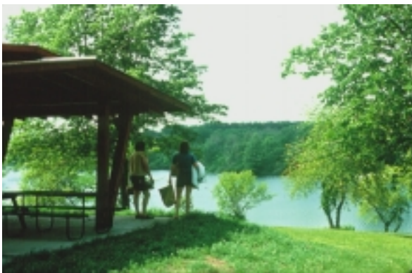
Red Haw State Park (Lucas County)

sewage overflows, malfunctioning septic systems, animal waste, polluted storm-water runoff, and boating wastes. Children, the elderly, and people with weakened immune systems have a greater chance of becoming ill when ingesting contaminated water.