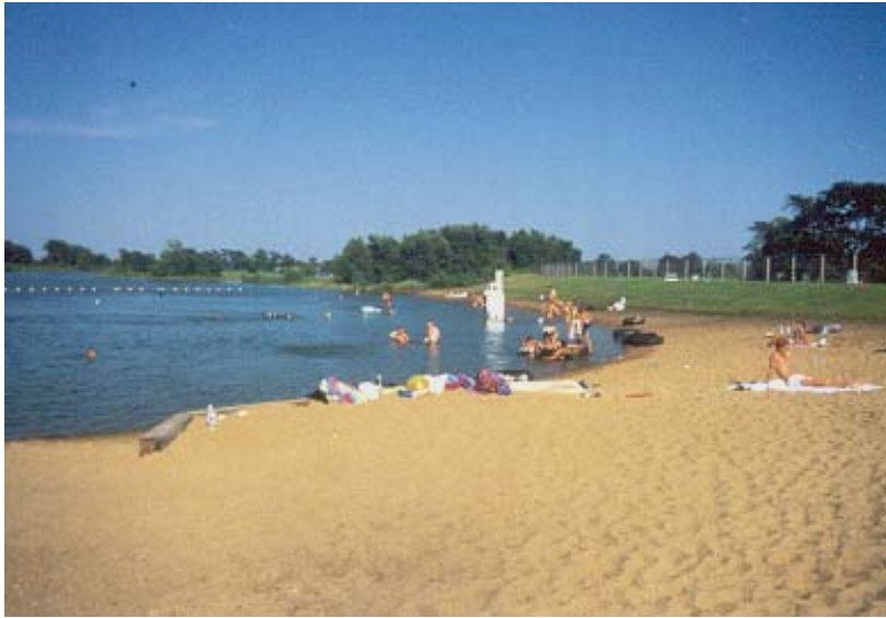
Swimming at George Wyth State Park, Black Hawk County.