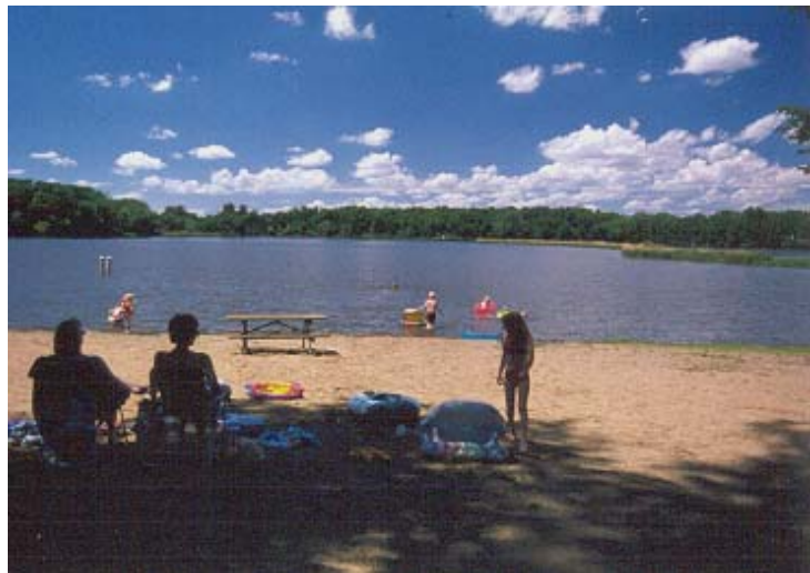
Beeds Lake beach, Franklin County.

Swimming in lakes or any other natural body of water involves risks. By far, the greatest risk is drowning caused by cloudy water, fast currents, submerged objects, or the lack of lifeguards or direct supervision. There is also the risk of contracting a waterborne illness from swimming in contaminated waters. The main objective of beach monitoring is to evaluate the level of fecal contamination by monitoring the water. Based on this monitoring, the DNR informs the public of the risk of waterborne illness by posting advisory signs at beaches where bacteria levels are elevated.