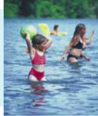
Pine Lake State Park, Hardin County.

Visit www.state.ia.us/dnr to view the weekly levels of fecal coliform bacteria at Iowa's 35 state-owned beaches. For more information on the beach monitoring program, call (319) 335-1575 or visit the Web site at http://www.igsb.uiowa.edu/water .