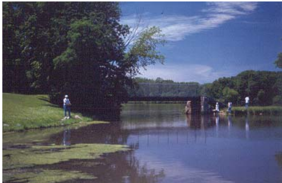
Fishing at Beeds Lake, Franklin County.