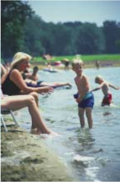
Union Grove State Park, Tama County.