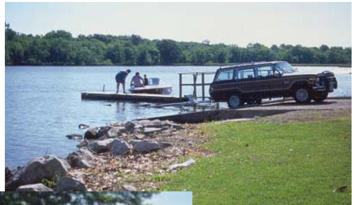
Boating on Lake Darling, Washington County.

The EPA recommended guidelines (Figure 3) do not indicate a level of zero risk and, in fact, a beach having the