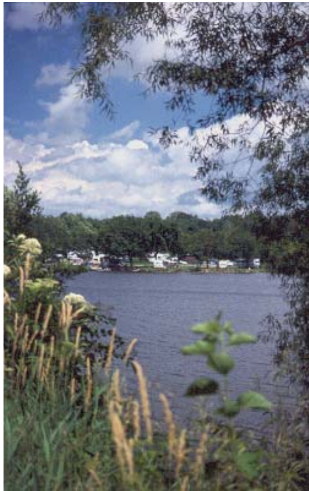
Rock Creek State Park, Jasper County.

Researchers throughout the country have been working on source identification strategies which have ranged from chemical monitoring to various microbial molecular methods. Recently, the DNR has obtained a grant to utilize one of these methods (DNA fingerprinting) in the Upper Iowa Watershed, which covers areas of Allamakee, Howard and Winneshiek counties. This method requires the establishment of a fingerprint database of known animal E. coli isolates. Once a substantial number of E. coli isolates are fingerprinted, unknown samples from streams or lakes can be compared to the database to assess the potential source of contamination. The DNR is currently taking samples to build the fingerprint database for the Upper Iowa Watershed and several other watersheds in Iowa.