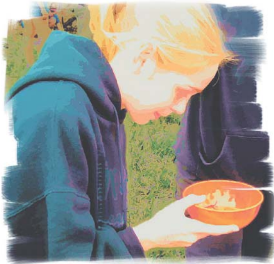
Student sampling for benthic macroinvertebrates.